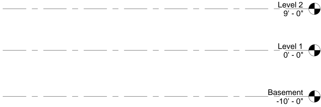
① East 1" = 10'-0"